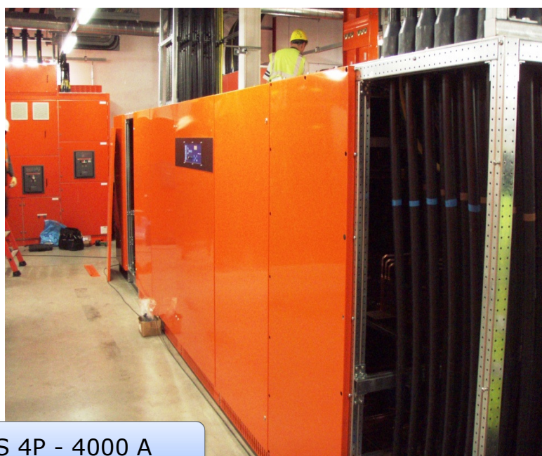
STS 4P - 4000 A