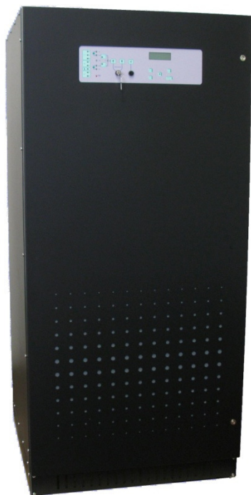
STS 4P - 250 A